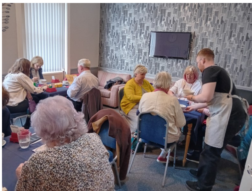
Lunchtime in one of the cafés

The day was rounded off with a meal in Taal, the award winning Indian restaurant in the town, and then a superb concert in Avendale Church in the evening. As a result of the day £2,000 was passed on to HHI for the Choongo Challenge Appeal.