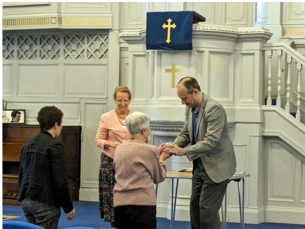
Presentation of Café Bridge Day prizes

In June 2024 Strathaven Friends of HHI ran their second Café Bridge Day. This, again was a great success with bridge players coming from far and wide to play in cafes and restaurants in Strathaven.