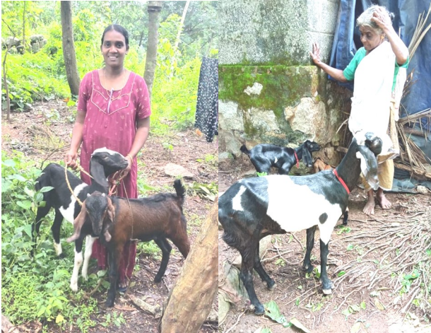
Manchu was able to buy two younger goats