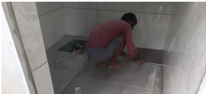
Tiling in progress

Our home for destitute women, rescued from the streets of the Thiruvananthapuram district of India, continues to thrive. Having finished the women's daytime washing / toilet area (see our Spring issue), we were able to send out some more money for work on the outside toilets to be completed – and it really does look great! We continue to send out about £400 each month, which enables the home to feed, clothe and support the 20 women who live there long term, as well as providing medicines and medical care for those who need it – a bargain at just £20 a month each!