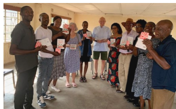
HHZ staff happy with their gift of hymn books

Morning payers and hymn singing, both in Tonga and English, started each day. The eight HHZ staff were very pleased to receive their gifts which included clothing, soap, and hard-back copies of Mission Praise hymn books, all of which had been brought in the suitcases by the UK visitors.